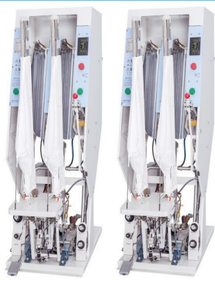
2 x YPS-404